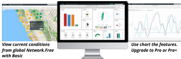
View current conditions from global Network. Free with Basic