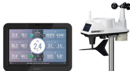
Shown here: Wireless Vantage Vue with console

Vantage Pro2 stations include a console and a versatile integrated sensor suite (ISS) that combine Davis rain collector, temperature and humidity sensors and anemometer into one package. You can customize your Vantage Pro2 by adding consoles or special-purpose options. Vantage Pro2 weather stations are available in both wireless and cabled versions. Only the Vantage Pro2 Plus includes UV and solar sensors; however, both stations can be customized with a range of add-on options, long- and short-range repeaters and application-specific systems.